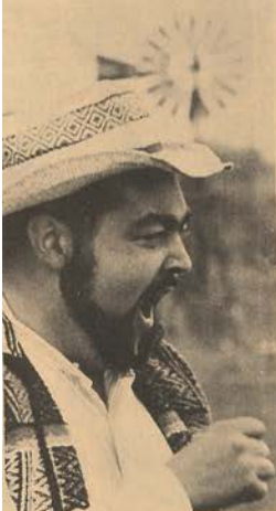
His beard didn't place in contest—started too late.