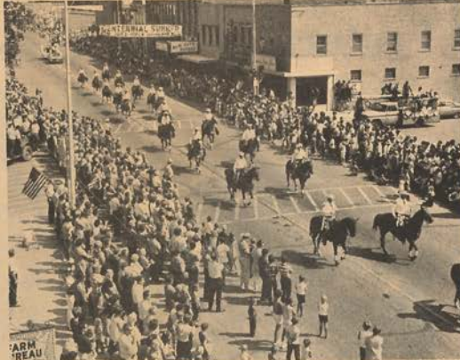
CROWDS LINED STREET TO WATCH PARADE Sioux Falls mounted sheriff's patrol.