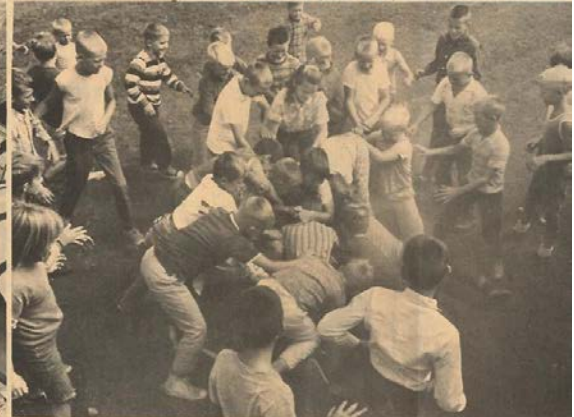
EVERYONE GOT INTO THE ACT Pig contest drew large crowd at Luverne Fairgrounds.

Friday night kicked off with an old time dance at the National Guard Armory which started at 9 p.m. The Luchtels were a band that played old-time music in the area for many years.