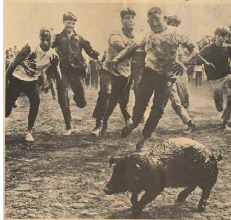
THE SCRAMBLE IS ON And the pig is in the lead.