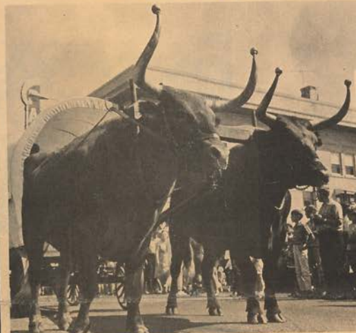
YOKED OXEN PULLED COVERED WAGON Way it all started 100 years ago.