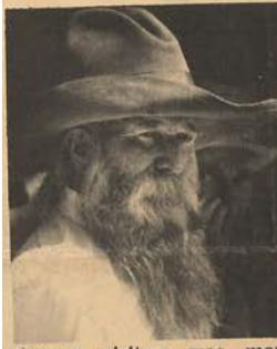
Among visitors was man