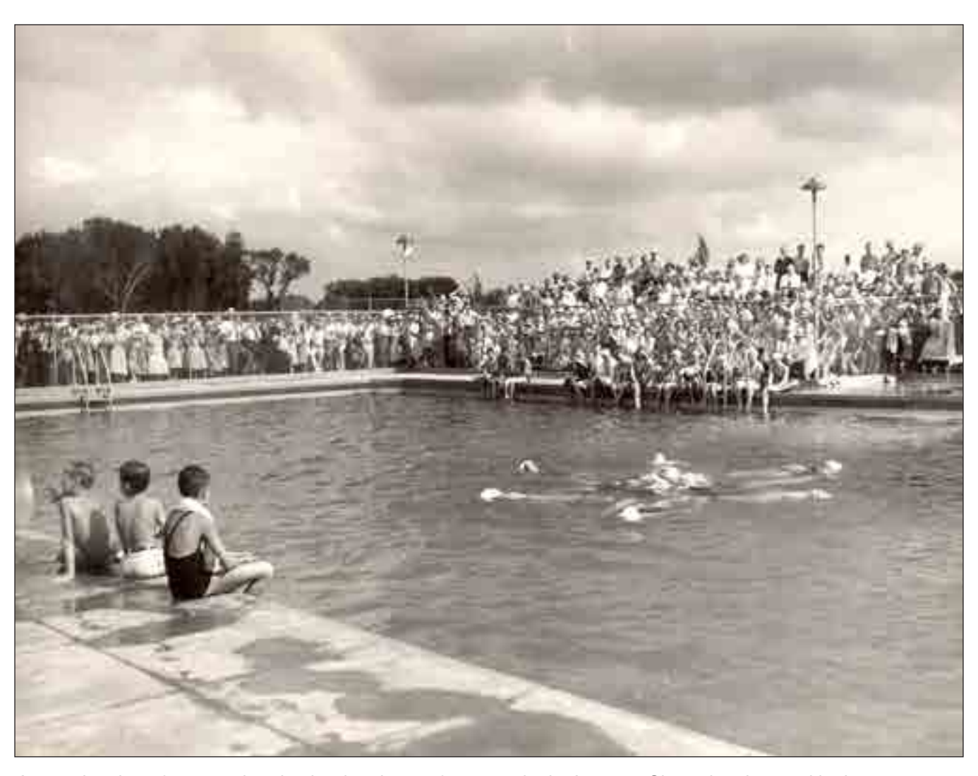
A crowd gathers for a synchronized swimming performance in the Luverne City swimming pool in the 1930s.