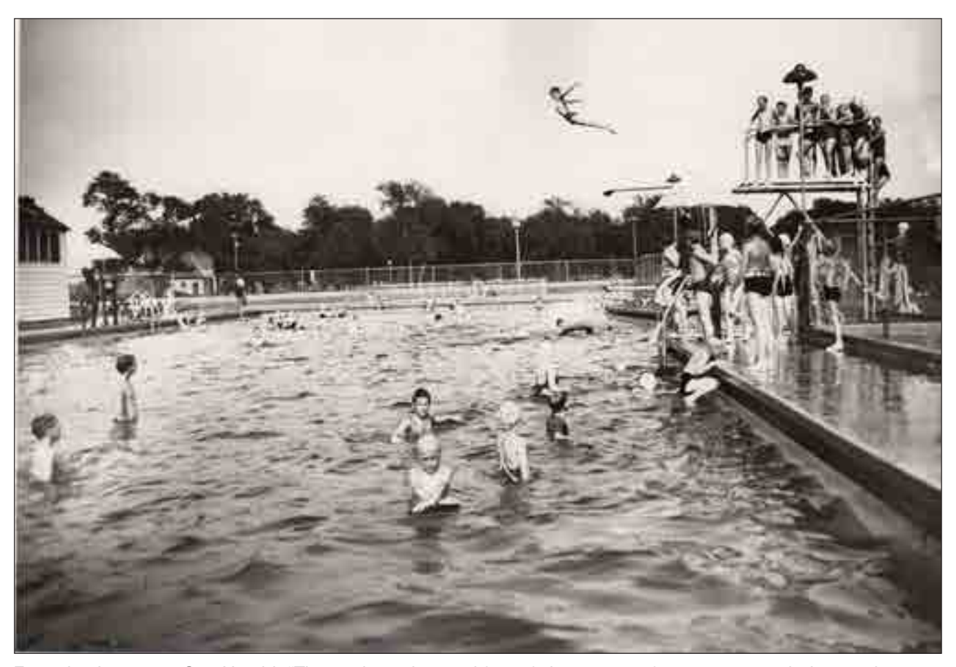
From the June 1939 Star Herald: "The pool may be used free of charge every forenoon on week days and on Tuesday and Thursday afternoons. On Thursday evening it will be open free to adults only. A differentiation has been made as to children and adults, the former including all high school students and younger children, and adults consisting of all over 18 or anyone having graduated from high school."