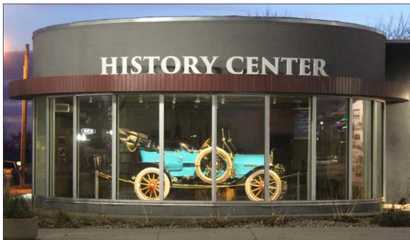
An original 1911 Luverne Thirty on display in the History Center, Luverne.

On Saturday, May 28 from 1 to 4 p.m. the Luverne Thirty will be dedicated.