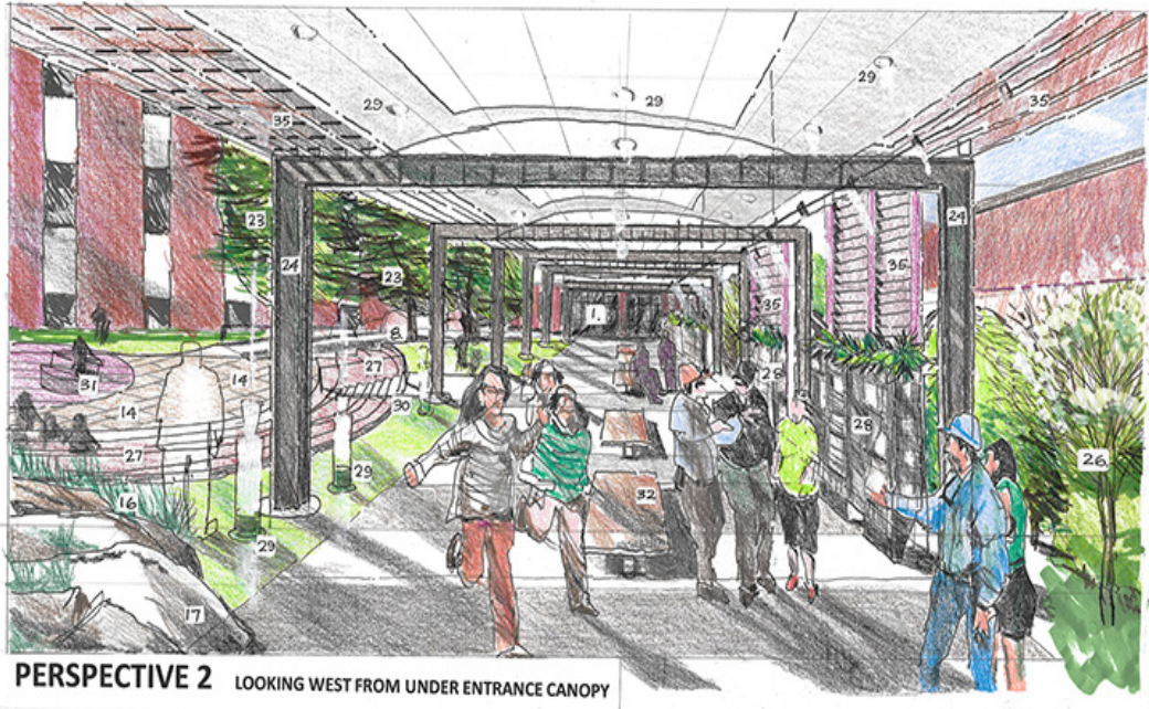
PERSPECTIVE 2 LOOKING WEST FROM UNDER ENTRANCE CANOPY

Next month, Klinefelter said Oh’Landscapes