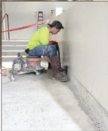
A worker from Wisconsin Terrazzo sands the terrazzo kick walls Friday in the hallway leading to the new performing arts center at Luverne Public Schools.

*Reprinted from the April 15 Star Herald