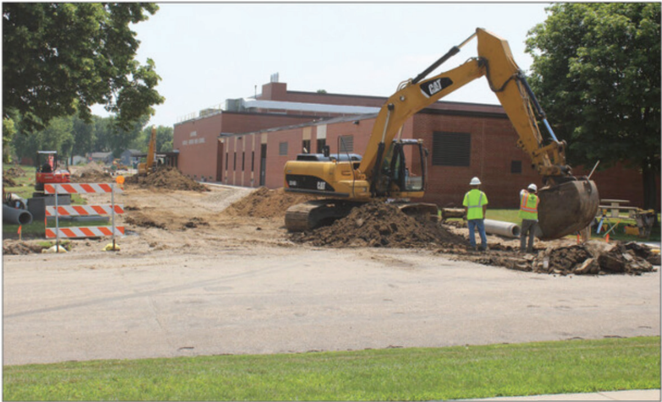
0715 School Build NE Park Street