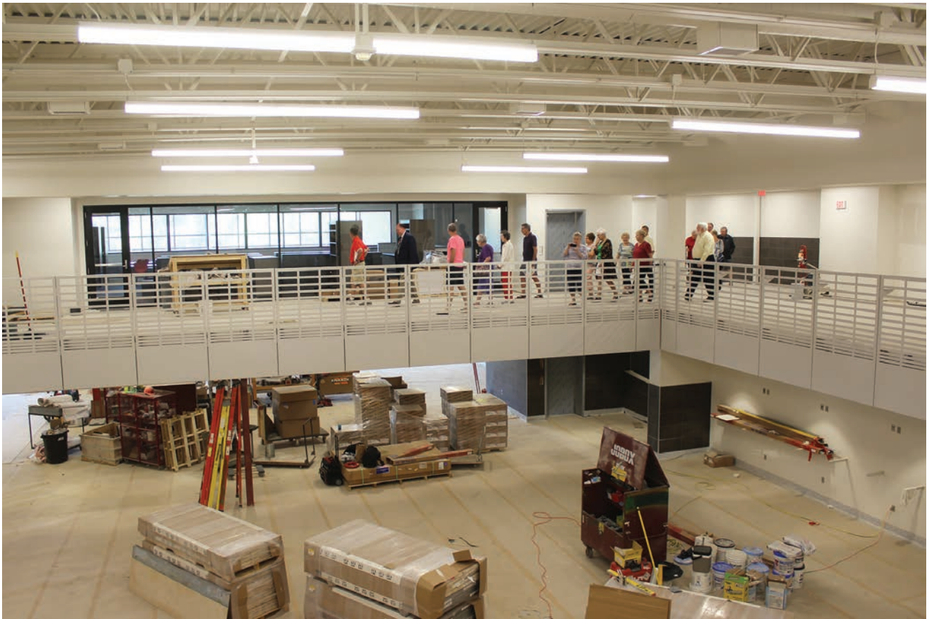
0610 Campaign 2184 Update

Retired teachers and support staff of Luverne Public Schools tour construction on the school campus in June as part of the 2184 Campaign to raise funds for enhancements as the construction and remodel of the middle-high school wrap up this summer. They're pictured in the new commons for an up-close look at the new media center.