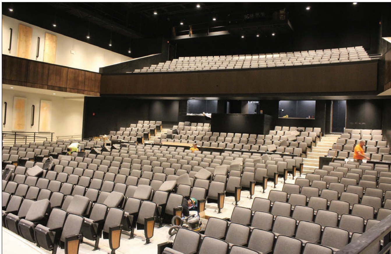
0715 School Build PAC