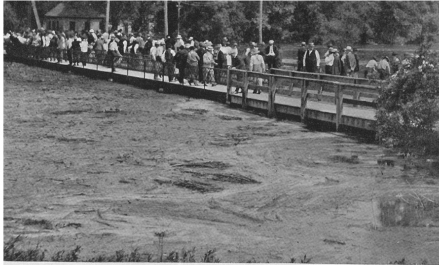
Crowd Watching Rising Waters at Bridge, 6-13-14.

In early September 1913, the old city jail was condemned by the State Board and the newspaper reported that “the drunks are happy.” An agreement was made with Sheriff Black to house the prisoners in the county jail until they could be arraigned with the agreement that the City would pay for housing. The majority of city arrests were for intoxication. After a couple of weeks, Sheriff Black informed the city police that he would no longer accept their prisoners due to the fact “that in the state of intoxication that prisoners are brought in, they create many instances of disturbance and make the days