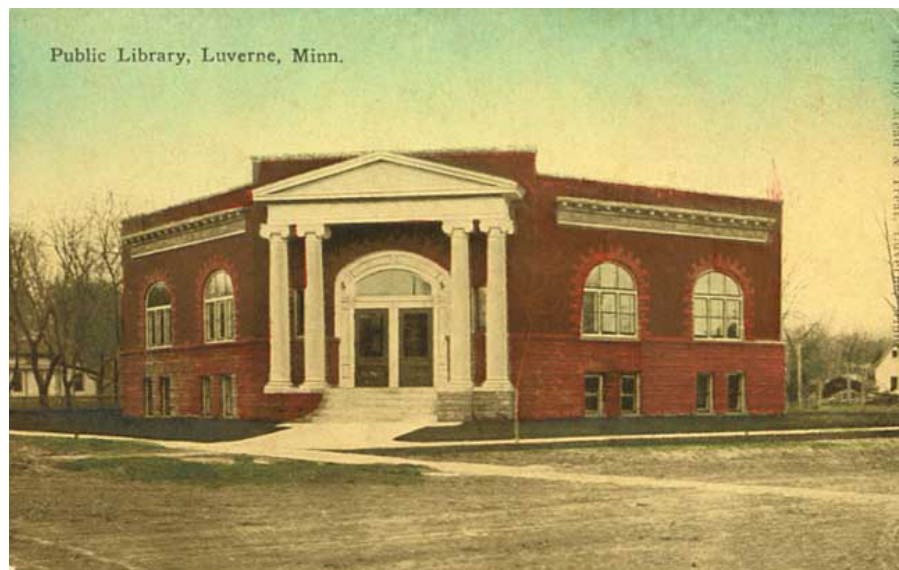
On Wednesday, December 21, 1904, the new library building was dedicated at the northwest corner of Lincoln Street and Freeman Ave.