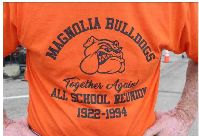
Magnolia Reunion