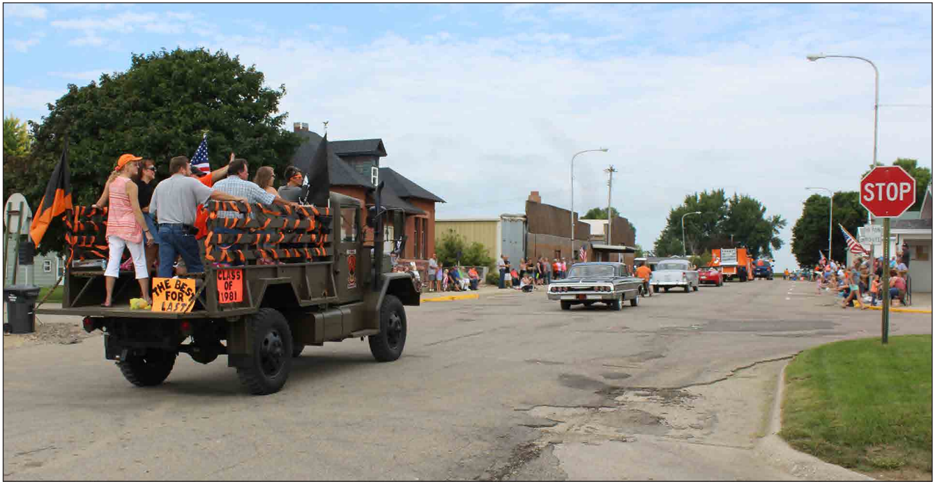
0906 Magnolia Reunion

The MHS Class of 1981 sports the sign "The Best for Last" as final graduating class of Magnolia High School. They rode in a 1973 M35 military truck owned by Lon Remme.