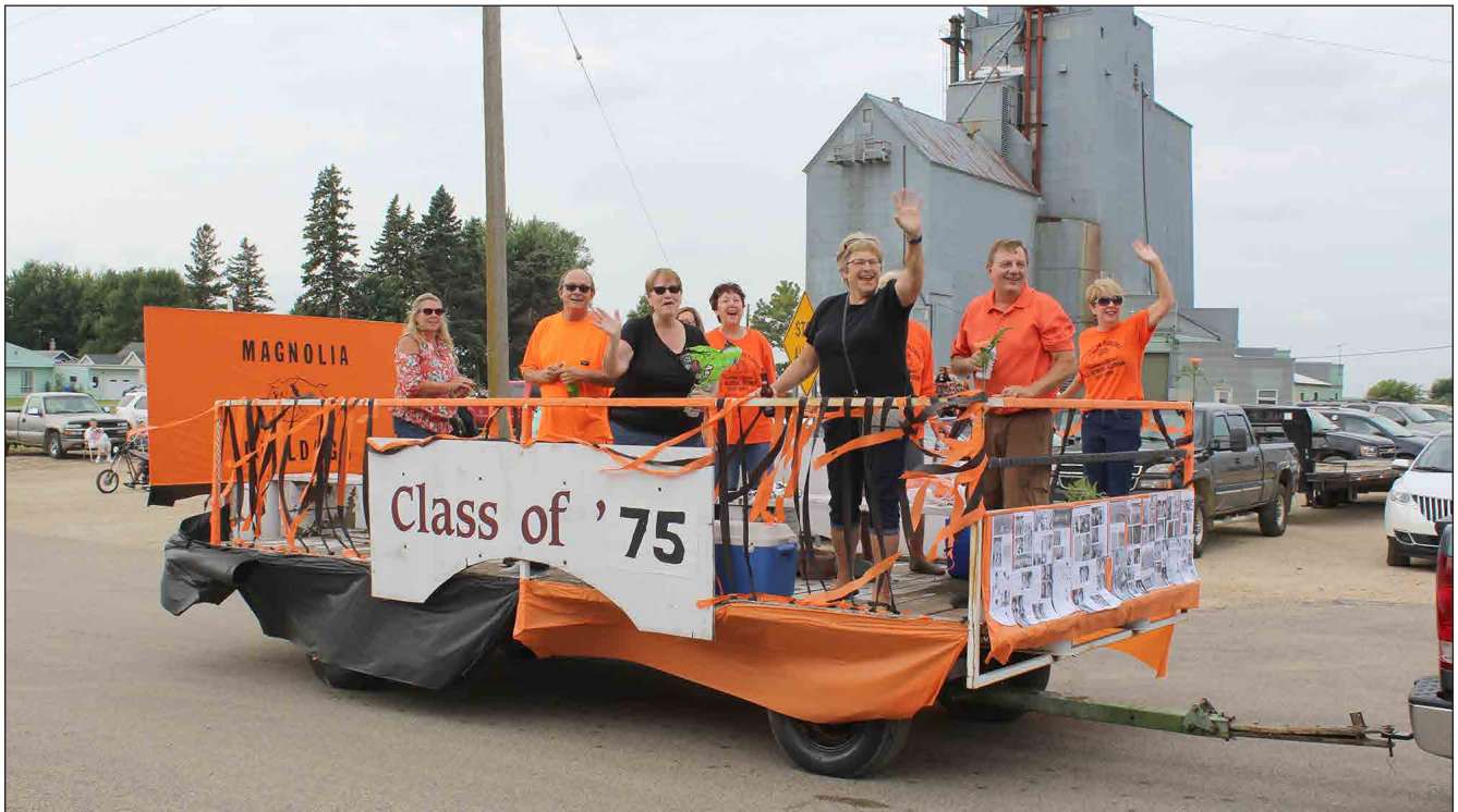
0906 Magnolia Reunion