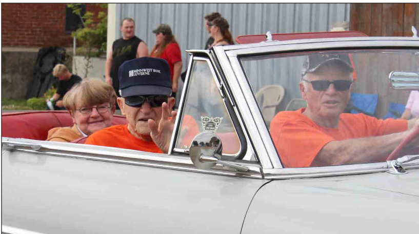
Magnolia Reunion