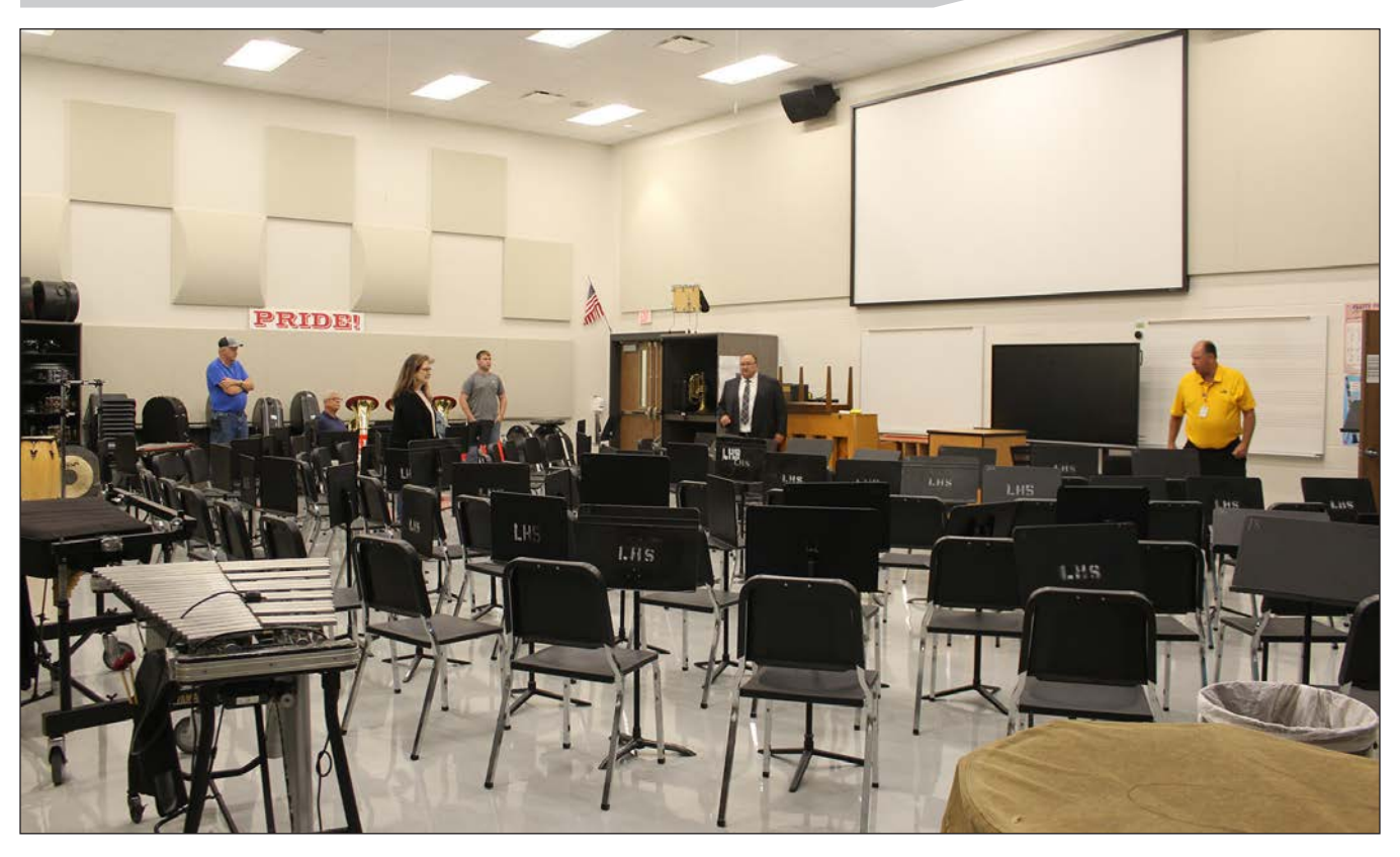
Band and choir rooms are located near the performing arts center. The former music area now houses the weight room.

upgrades into one major project — funded through a new bond — which would start immediately after the prior one was paid off," Hartman said.