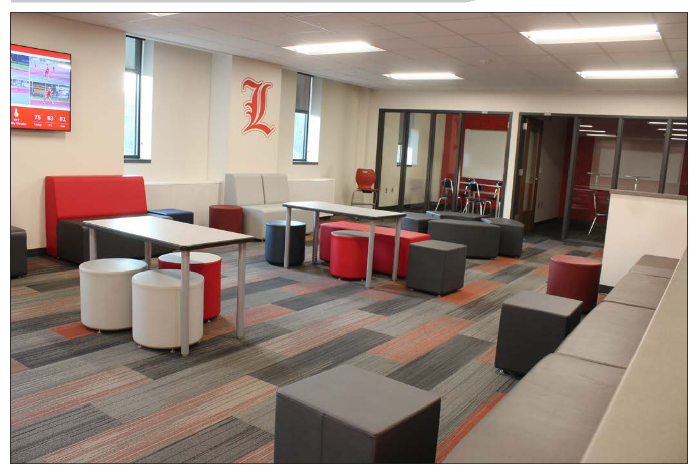
"Learning pods" reflect modern teaching and learning styles and promote collaborative research study.

building, they endured the noise and debris from construction."