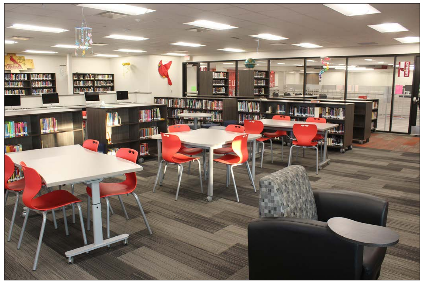
The new middle school-high school media center has updated technology and space for modern student research.

in the district through another possible bond referendum.