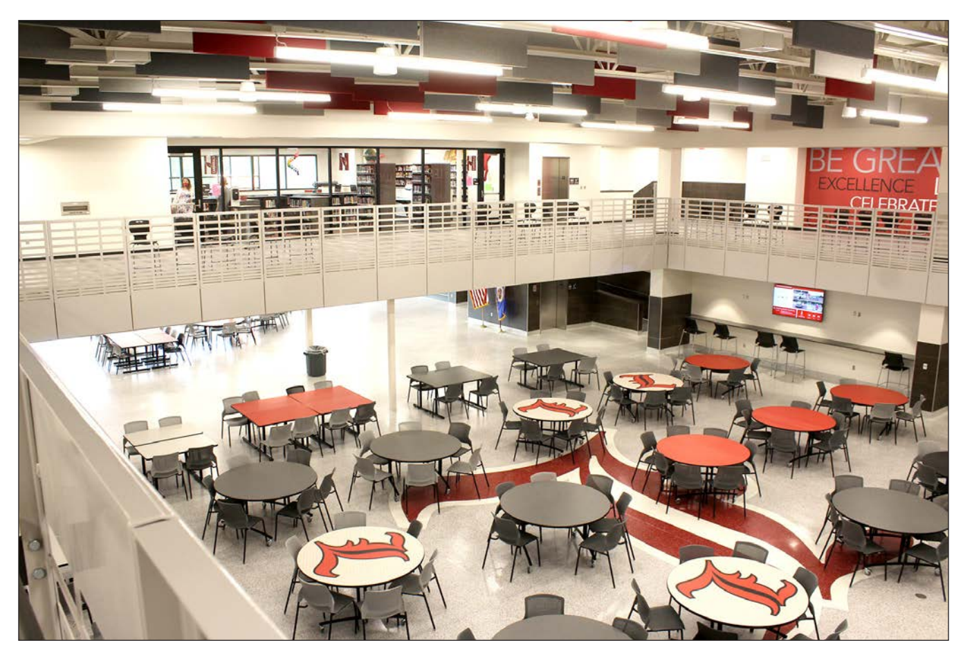
The media center overlooks the commons below and a giant "L" that is embedded into the floor tiles. The new middle school high school kitchen is adjacent to the commons, relocated from its previous location in the basement.