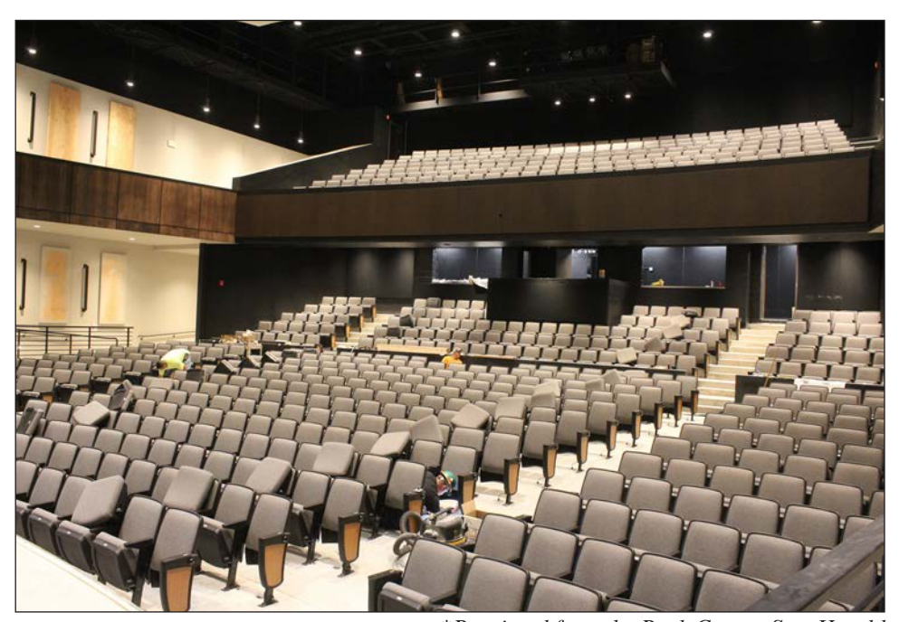
*Reprinted from the Rock County Star Herald