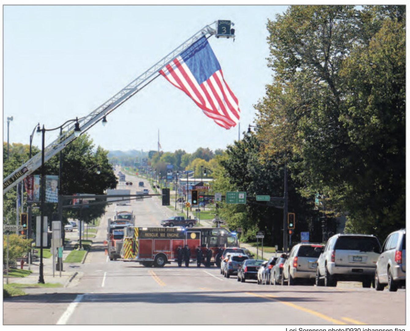
0930 johannsen flag