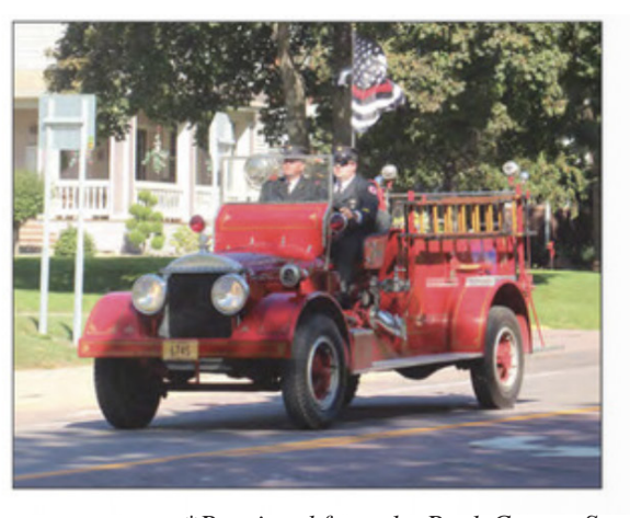
*Reprinted from the Rock County Star Herald