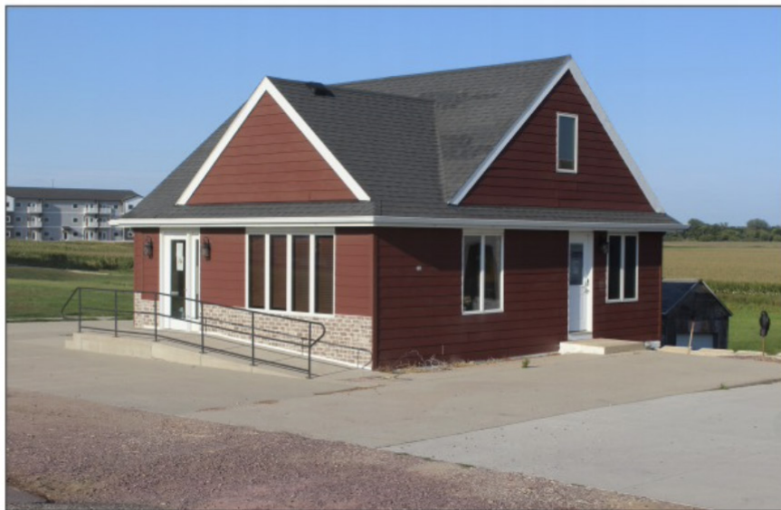
0908 School City Construction

“My goal for that class is to be able to encompass as many types of trades and occupations that will be involved in building a