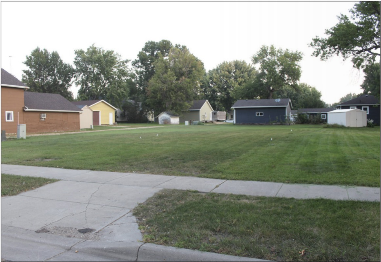
0908 School City Construction

This empty lot on East Dodge Street in Luverne will soon be the location of a house move and remodel under the direction of the new vocational education class at Luverne High School that will introduce students to trades in home construction.