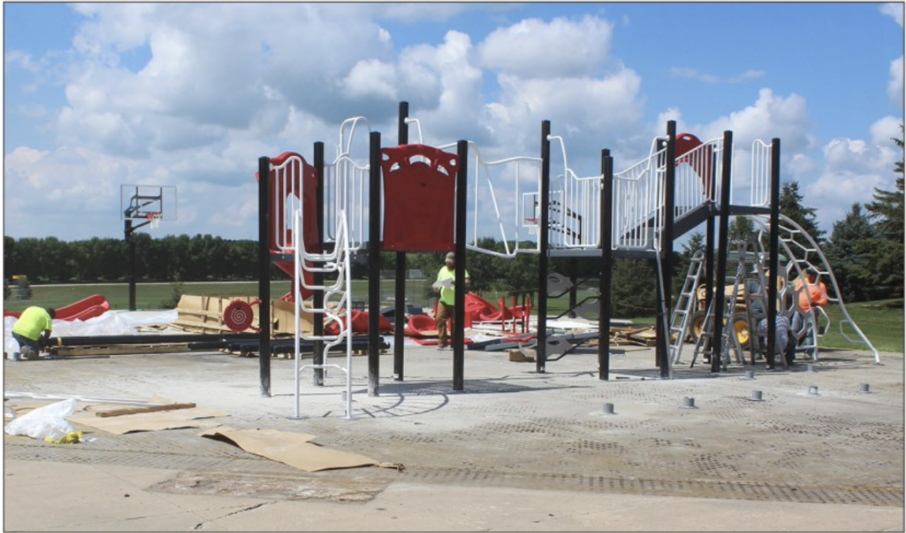
0825 New Playground