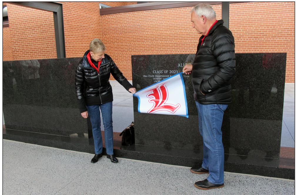
1012 HOF 2023